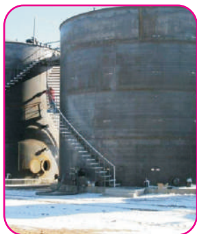
Tank Fabrication Work