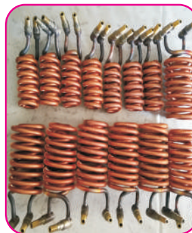
Heating / Cooling Coil