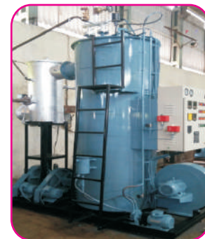
Hot Water Generator