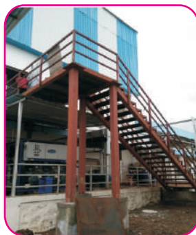
Heavy Industrial Works