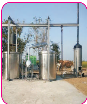
Oil Distillation Unit